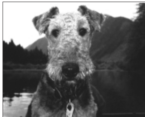
Photo contest winner is...

Boxaire, an Airdale, is seen here paddling Widgeon Creek at Pitt Lake. He and his parents were raised on Pets First.