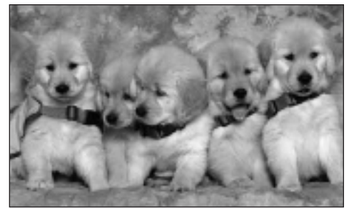
The "F" troop; aptly named Fraser, Friday, Freeway, Fergus, Franny, Freesia, Faith and Faedra.